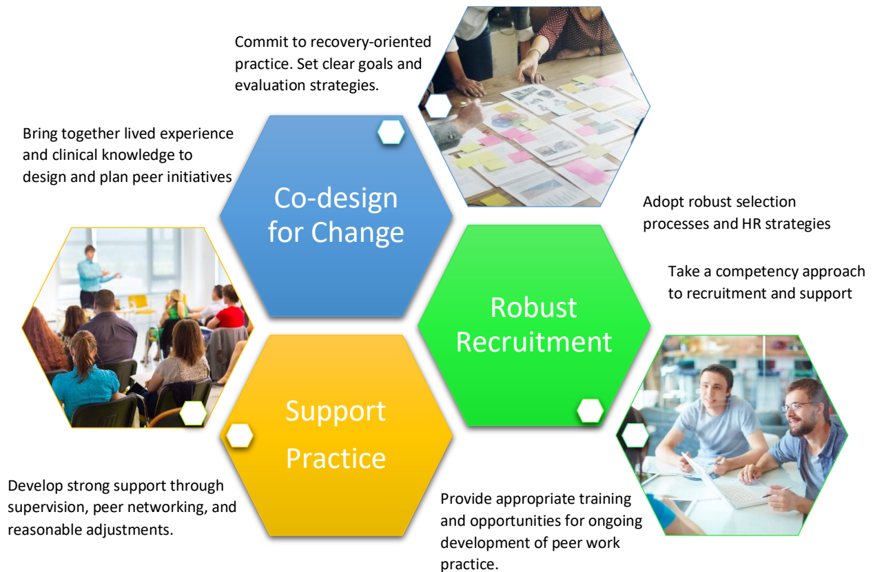
Figure 1: Organisational Steps Towards Safe Effective Peer Work

This paper is Part A of a suite of resources that provide a guide to the development of a peer workforce for eating disorders. The guide outlines selected evidence from the general mental health sector and eating disorder peer work initiatives and provides practice guidance based on existing peer work programs in Australia. Part B explores the peer work approach and what sets it apart from other approaches to mental health care. Part C of this Guide explores how organisations can influence the safety and effectiveness of peer work programs and roles.